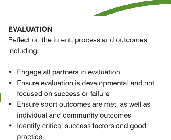
Diagram 3: Creating a Community Development Pathway

IMPLEMENTATION Build community capability including: