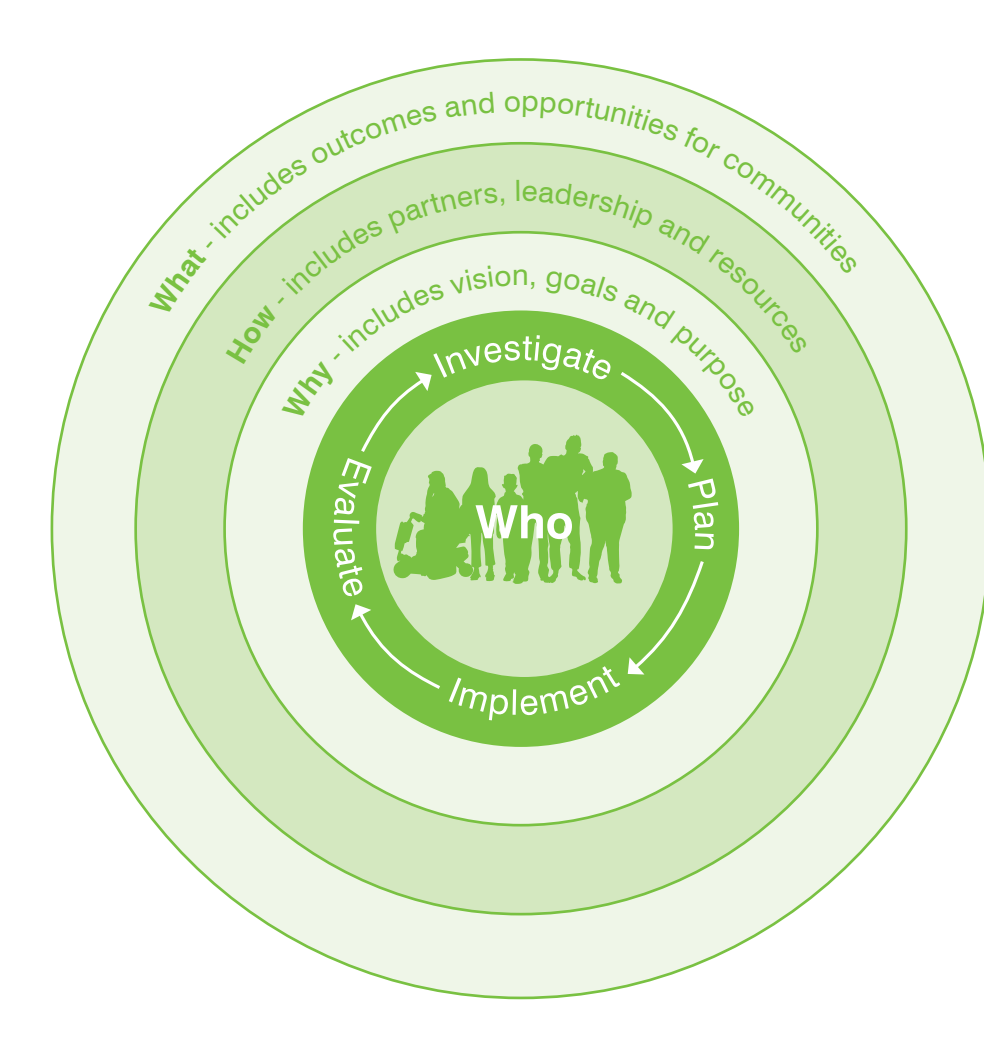
Diagram 2: Community Development planning cycle

The diagram below outlines the purpose for each stage of the community development pathway and how this could be achieved at Sport NZ.