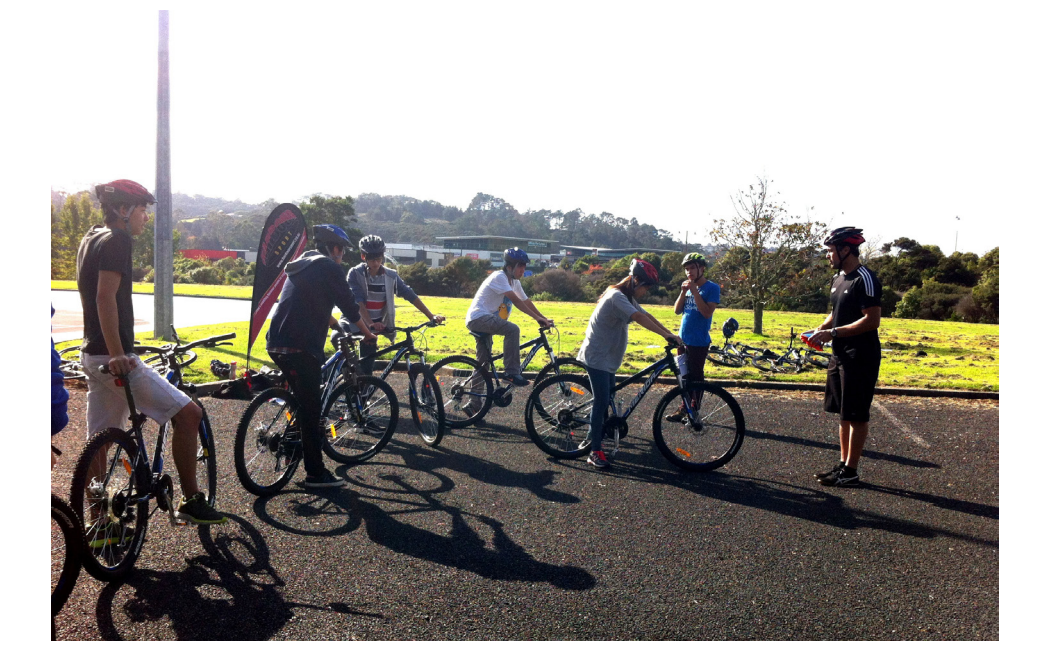
ActivAsian cycle skills instructors training to deliver the Bike NZ Learn to Ride programme in their communities, 2014

It is designed to enable individuals and communities to grow and change at their own pace, according to their own needs and priorities. While it is a collective process, the experience of the process enhances the integrity, skills, knowledge, experience and, where appropriate, equality of power for each individual involved. This ultimately provides for participant-centred outcomes. This contrasts with traditional sport delivery which typically measures outputs for individuals and the sport as a whole.